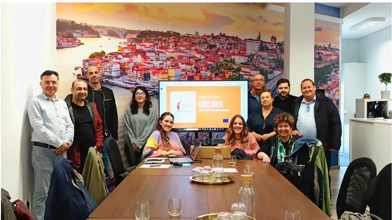
The partnership met in Porto, Portugal for the First Face-to-face Partners Meeting

Over the next few months, the partners will focus on the development and finalization of these materials, ensuring that they meet the needs of educators, providing an interactive and practical result. The application will also be translated into all the languages of the consortium to ensure its application in the partner countries and generate a greater impact at the international level.